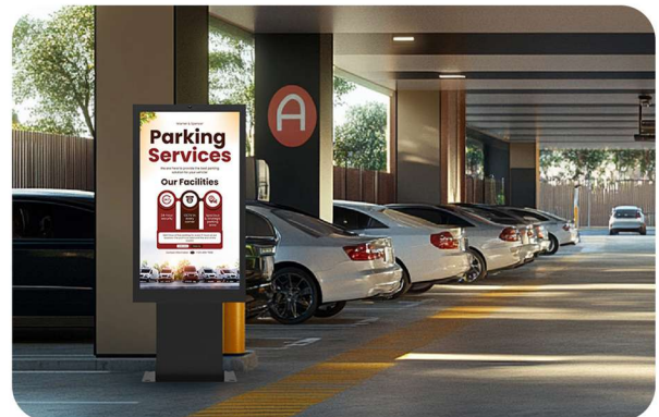
Parking Lot Building