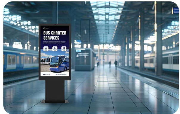
Station / Bus Stop / Public Space